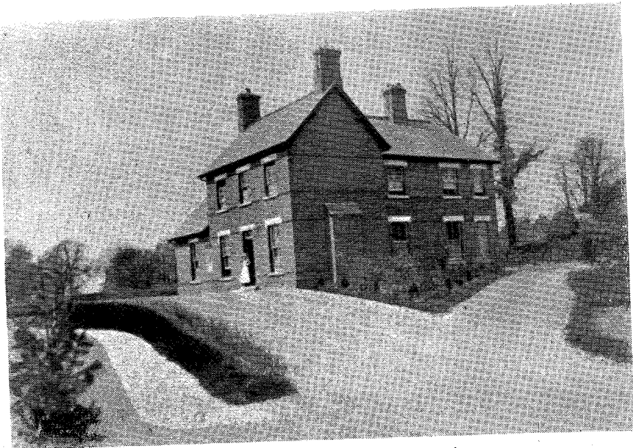
VICTORIA COTTAGE HOSPITAL, 1898