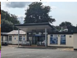
BISHOP'S CASTLE HOSPITAL

There is good news in Leicestershire, with Coalville Community Hospital opening a third ward with 15 beds. This is in addition to extra community hospital beds throughout Leicestershire. Good news as well for Bishop's Castle Hospital , where, following a public campaign and recruitment drive, it is hoped that beds are due to reopen.