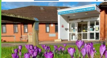
COALVILLE COMMUNITY HOSPITAL.

Do follow this link to our news pages, to catch up with the latest news on community hospitals.